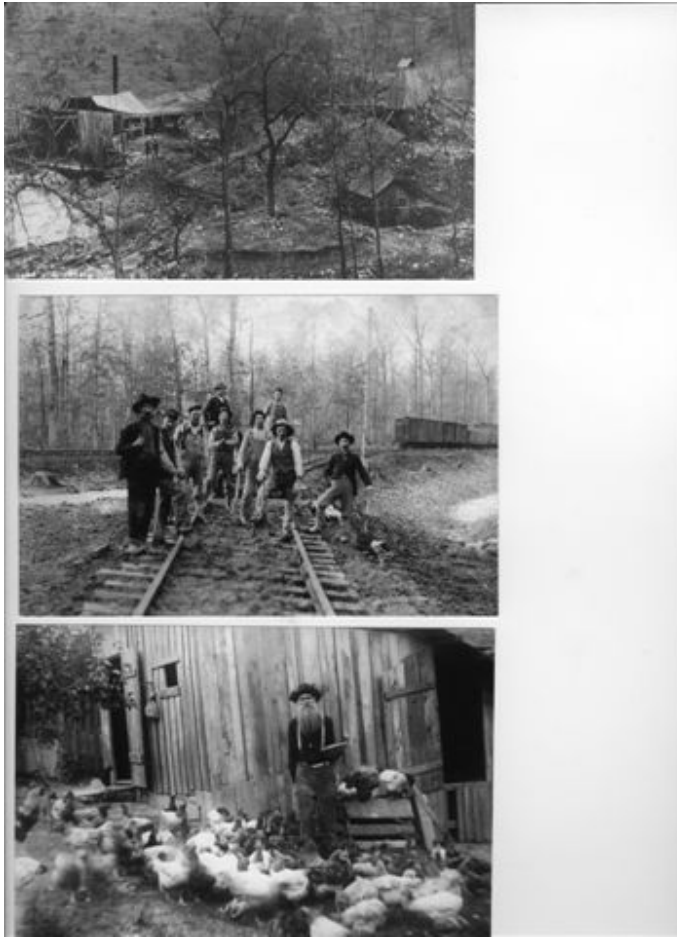
Old Timers in the Mountain Home area around Nettie's time.