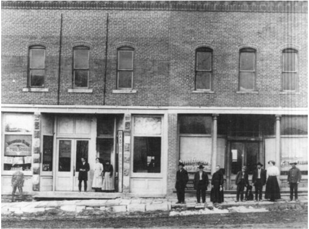
East side of the 1902 Mountain Home town square.